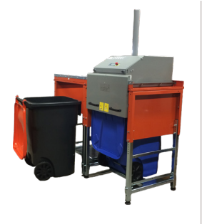
Designed to fit the standard 360 Liter bins in the market.

Model 4360 is user-friendly! The multichamber version is a convenient top-loading installation, while the single-chamber version has an easy wheel-in, wheel-out operation. Safety and quality are our hallmarks and the compactor provides maximum personal safety both for the operator and those in the immediate vicinity. A bin indicator assures that the machine can only start, when the bin is in the right position.