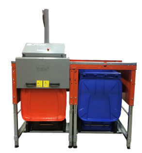
The multiple-chamber unit equipped with an apron with two handles