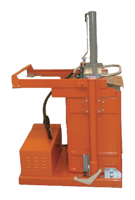
Mounted on wheels for easy manoeuvring when cleaning