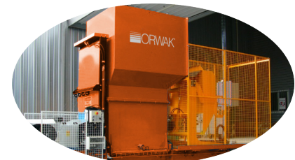
OPTION: BIN LIFTER

We reserve the right to make changes to specifications without prior notice. Bale weights are dependent upon material type.