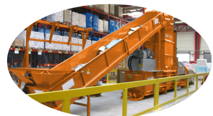
OPTION: CONVEYOR BELT